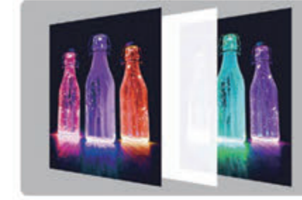
Image A-White-Image B