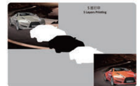
5 layers printing