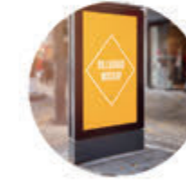
Advertising light box